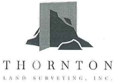
EXHIBIT A PROPERTY LEGAL DESCRIPTION

8803 State Highway 16 PO Box 249 Gig Harbor, WA 98335 T 253 858 8106 F 253 858 7466 thorntonls.com