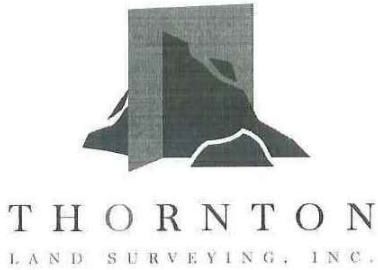
EXHIBIT A LEGAL DESCRIPTION

8803 State Highway 16 PO Box 249 Gig Harbor, WA 98335 T 253 858 8106 F 253 858 7466 thomtonls.com